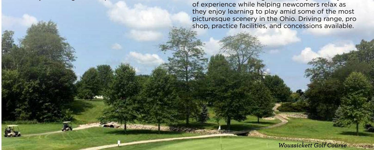
Woussickett Golf Course

Public course features a thought-provoking design that is sure to challenge serious players with years of experience while helping newcomers relax as they enjoy learning to play amid some of the most picturesque scenery in the Ohio. Driving range, pro shop, practice facilities, and concessions available.