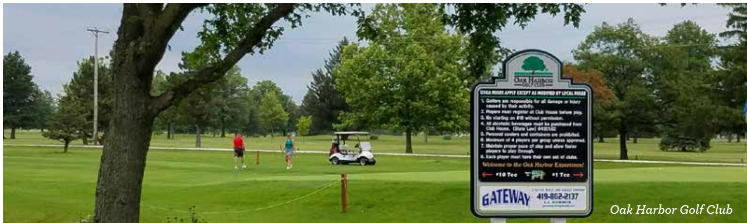
Oak Harbor Golf Club